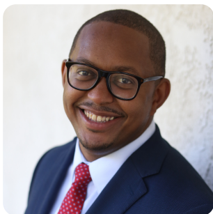
Vice Mayor Rex Richardson City of Long Beach